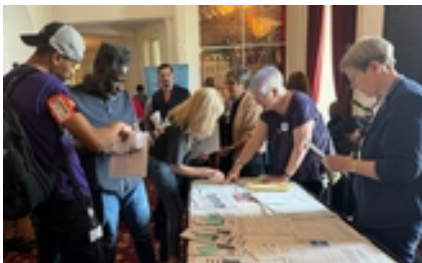
New Citizen Registration

If you are interested in any of the League's voter registration programs, send an email to league@lwvofvt.org .